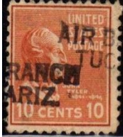
1.4243 AIR BASE BRANCH / TUCSON, ARIZ. Slight serif

The following is an illustrations of a Type referenced by the PIC Type Note, in the listings.